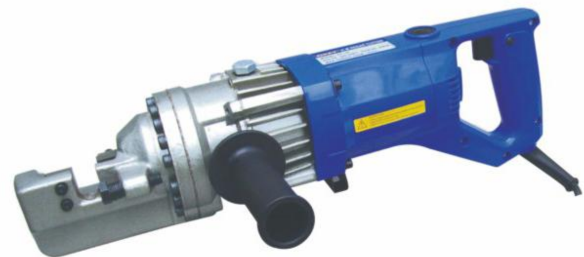
Package:one pc/Metal box/Cardboard Ctn Certificate: CE ROHS PSE KC