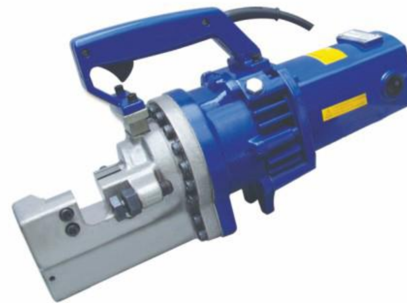
Package:one pc/Meat box/Cardboard Ctn Certificate: CE ROHS PSE KC