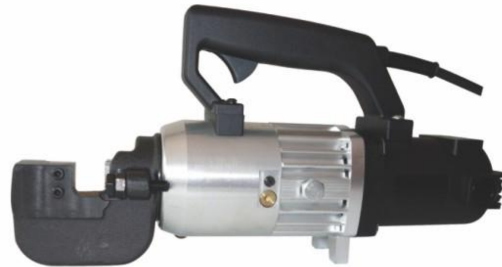
Package: one pc/Plastic box/Cardboard Ctn Certificate: CE ROHS