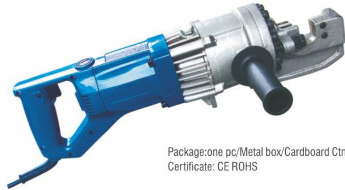
Package:one pc/Metal box/Cardboard Ctn Certificate: CE ROHS