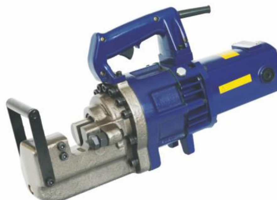
Package:One PC/Meat box/Cardboard Ctn Certificate: CE Rohs