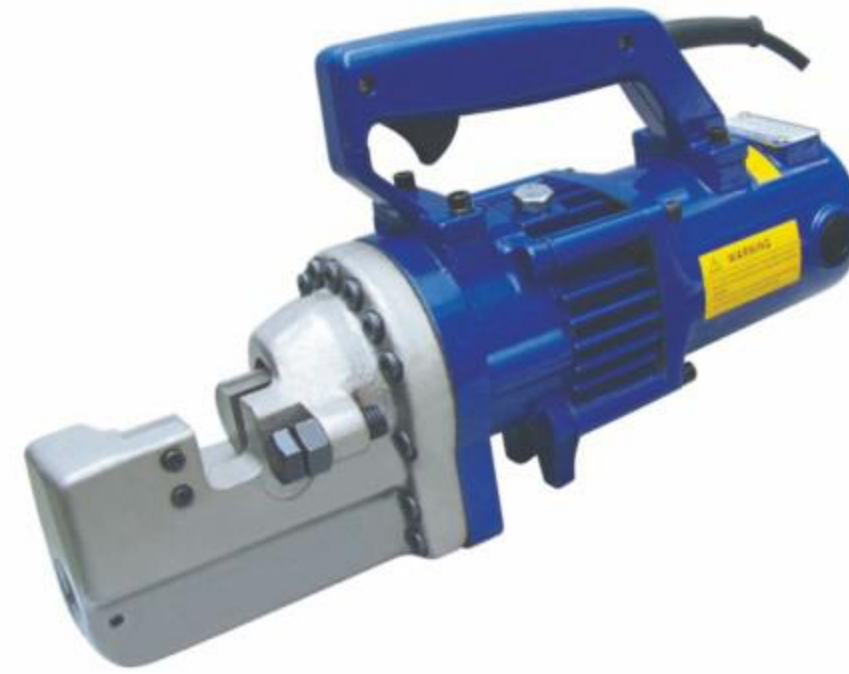
Package:one pc/Meat box/Cardboard Ctn Certificate: CE ROHS