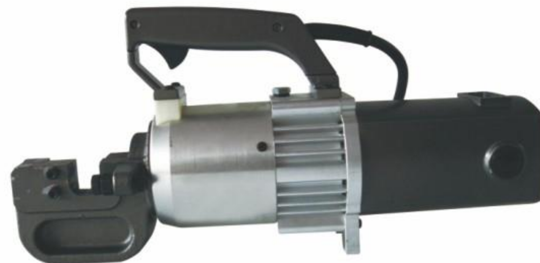
Package: one pc/Plastic box/Cardboard Ctn Certificate: CE ROHS