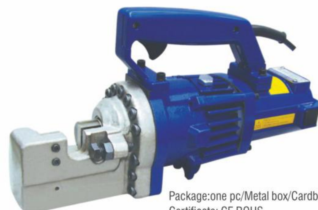
Package:one pc/Metal box/Cardboard Ctn Certificate: CE ROHS