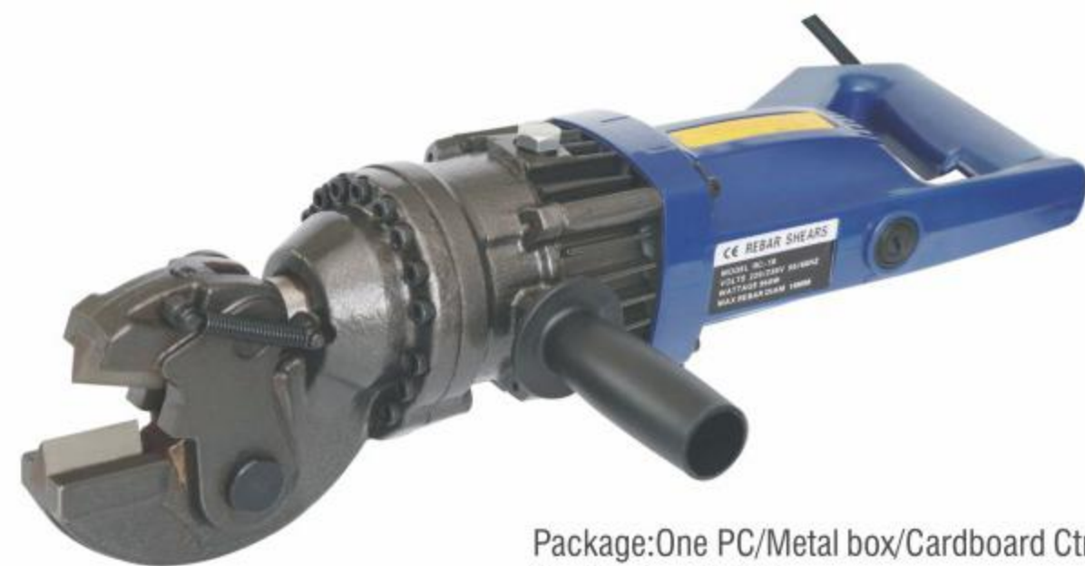
Package:One PC/Metal box/Cardboard Ctn Certificate: CE Rohs