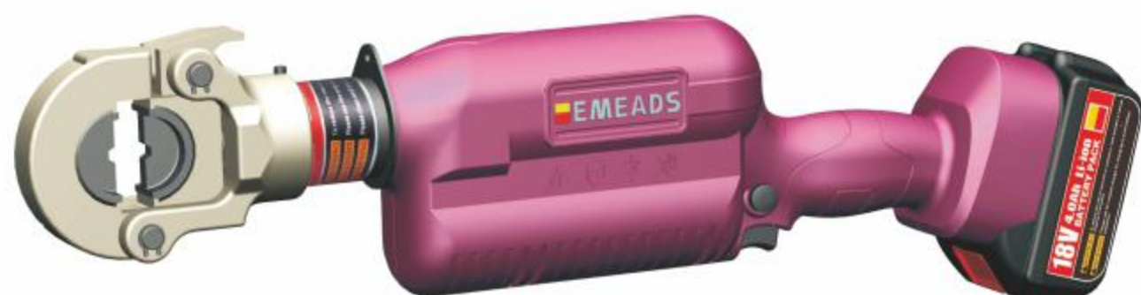
EA-300 Economical hydraulic crimping tool