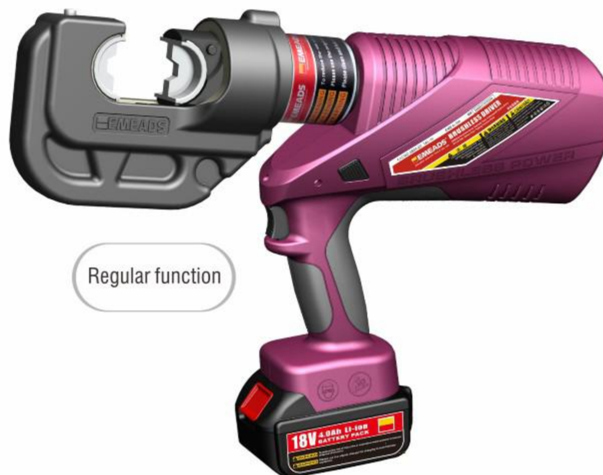
DE-400 (Brush-free drive)