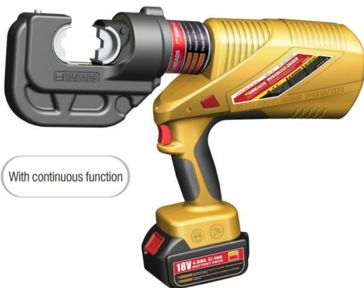
DES-400 (Brush-free drive)