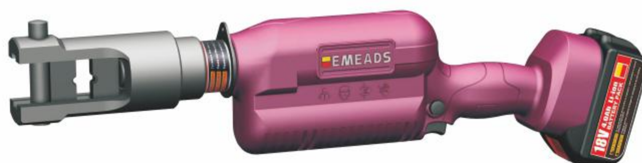
EA-300H Economical hydraulic crimping tool