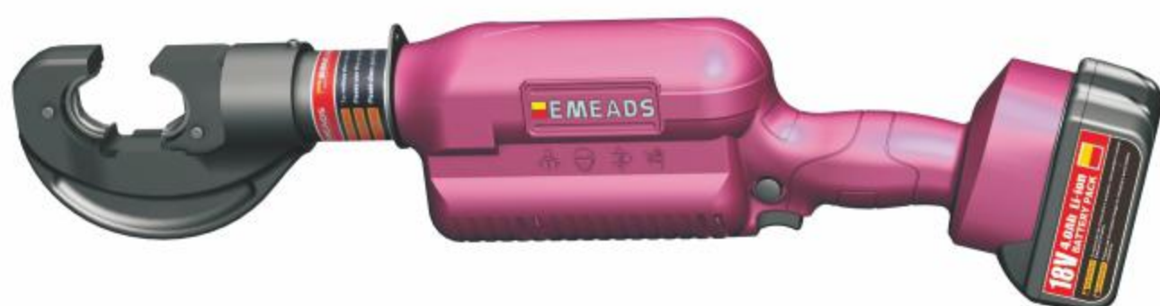
EA-300B Economical hydraulic crimping tool