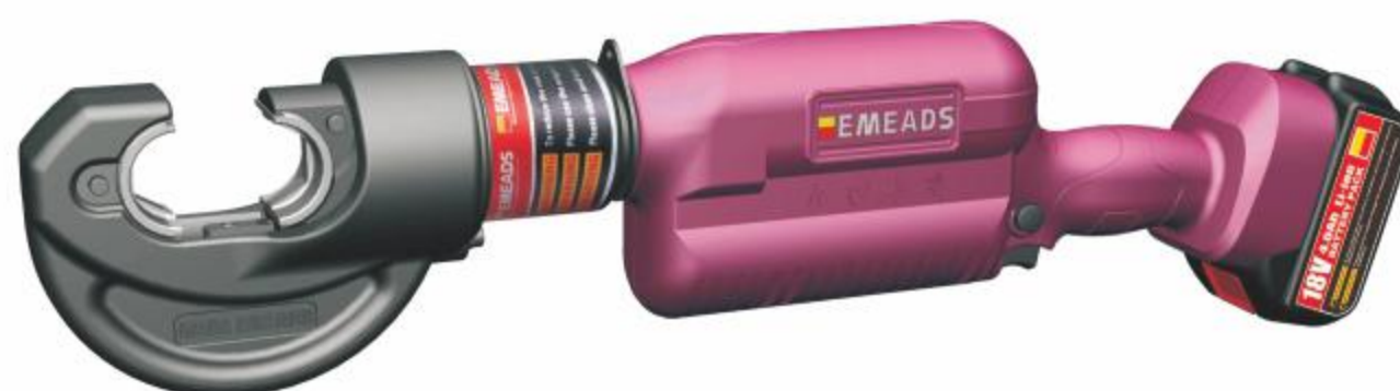
EA-400B Economical hydraulic crimping tool